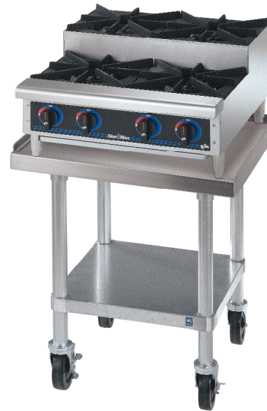
Model 604HD-SU with Optional Equipment Stand